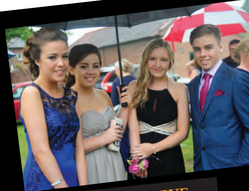
GOODBYE YEAR 11