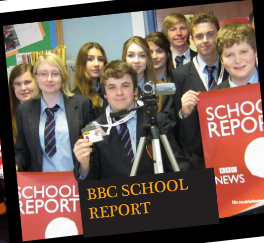
SCHOOL REPORT BBC SCHOOL REPORT