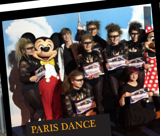
PARIS DANCE TRIP