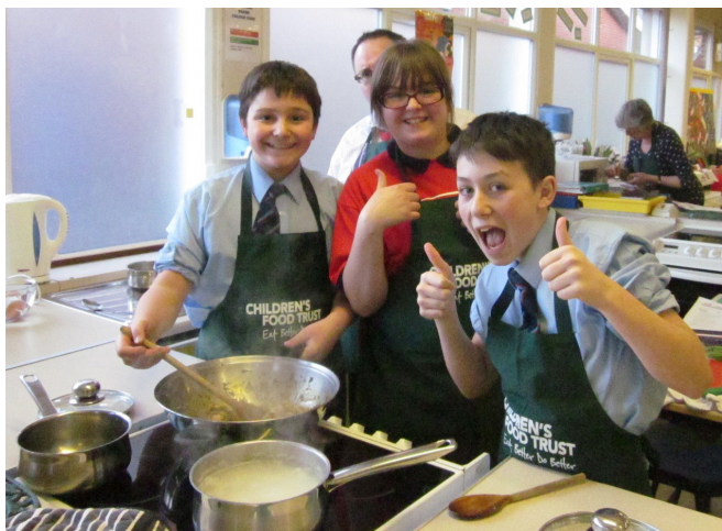
The annual BIG Cookathon, now in