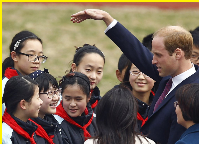
Our Partner School in Shanghai, Nanyang Middle School, was very excited recently to welcome a special visitor to their school – Prince William. “He was very nice and interacted with our students,” they reported.