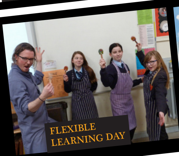
FLEXIBLE LEARNING DAY