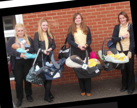
CHILD CARE BABIES